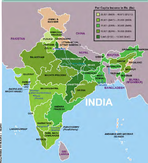
UMTRI / SHEKHAR ERINGTON

India is expected to be one of the top ten countries in vehicle sales by 2015, but it must overcome major obstacles to continue its rapid growth in the automotive industry, according to a recent study by UMTRI and the IBM Institute for Business Value. The world's second-most populous country, with more than 1.3 billion people, India faces such challenges as the need for a better transportation infrastructure, improved product quality, more skilled workers, changes in labor and tax regulations, and the need to increase the scale of their domestic companies to meet the demands of the global auto industry.