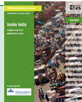
COVER ART: COURTESY OF UNIR/AAO AND IBM